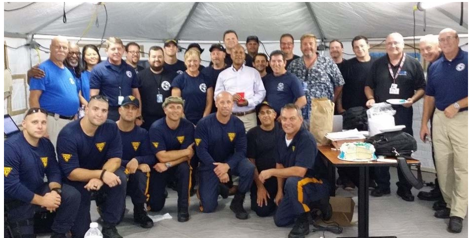
Members of the NJ EMS Task Force and NJSP/ NJOEM working together in the USVI