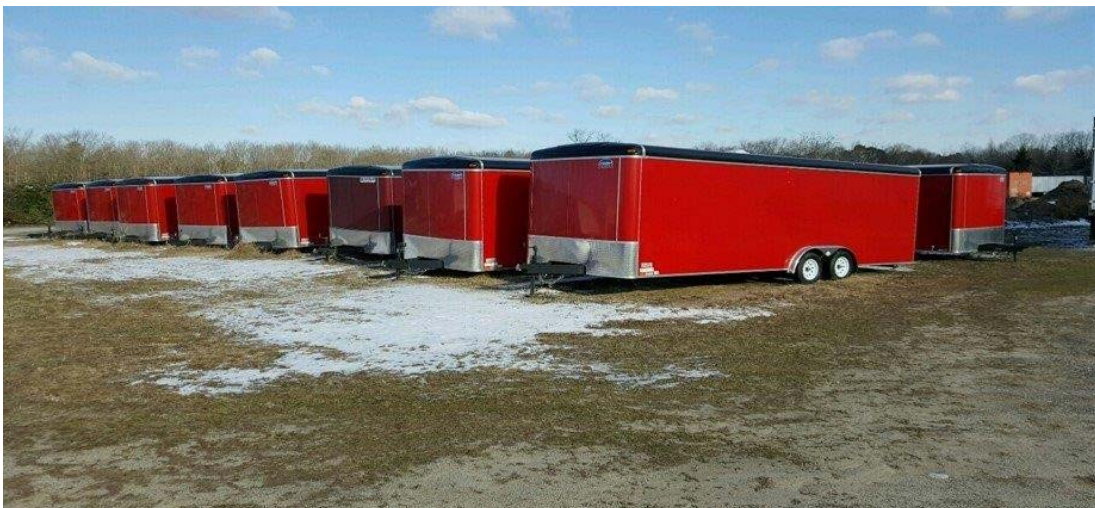
DHS trailers staged and ready to deploy with mass care supplies.

Our mass care logistical operation is extremely important and we continue to build upon our mass care resource supply to support our County partners in times of need. We rely primarily upon grant funds received from the Office of Homeland Security and Preparedness and other grant opportunities to support operations. We maintain a supply of mass care resources to support sheltering operations throughout the State. We have a number of utility trailers containing a supply of cots, blankets, and other mass care related items. We