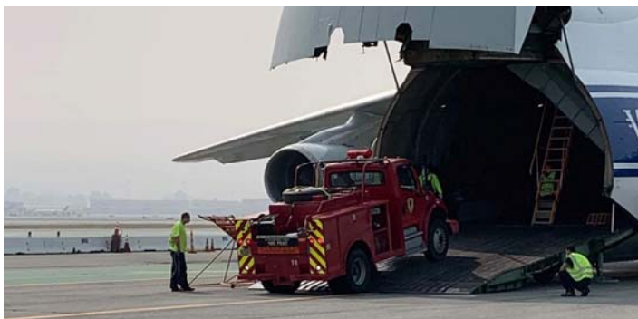
NJ fire engines arriving in California via airlift.

Ten Firefighters and several engines were deployed via airlift to California.