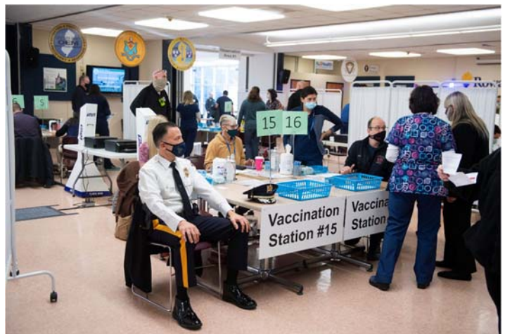
Opening day of Gloucester County COVID-19 Mega Site at Rowan College of South Jersey.

In the South, the region reps assisted the AHIMT, Virtua Health System, and Atlantic Health System with the sites at Rowan College of South Jersey in Sewell Township, Gloucester County; Lord & Taylor at the Moorestown Mall in Burlington County; and The Atlantic City Convention Center in Atlantic County. All three sites opened in the third week in January.