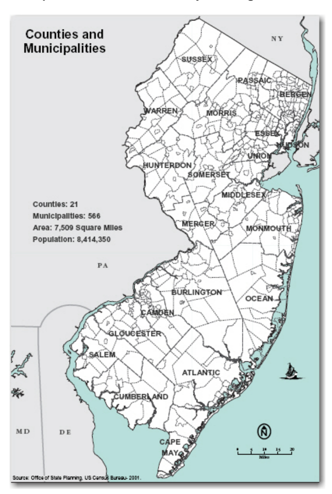
Figure E-1 Map of the State of New Jersey showing Counties

New Jersey was named for the island of Jersey in the English Channel, but is also known as the "Garden State". The State is located in the Mid-Atlantic region of the U.S. It is bordered by New York State to the north, the Atlantic Ocean to the east, Delaware to the south, and Pennsylvania to the west. It is about 150 miles long and 70 miles wide, comprising 8,722 square miles. The Delaware River is the largest river in the State, and defines the State's southern and western borders. New Jersey is the most densely populated State in the nation, and one of the most ethnically diverse. It is comprised of 21 counties and 566 municipalities. The largest municipality is Newark, with a population of 273,546 (as of the 2000 Census). The capital city is Trenton, which is located in Mercer County, which is also the geographic center of the State.